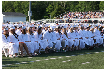
WELCOME AND SPEECHES