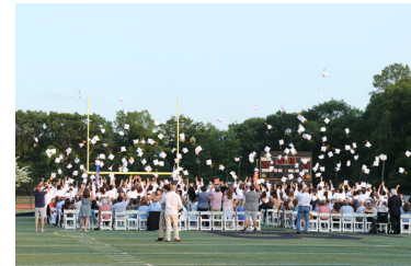
DONE! ON TO OUR NEXT CHAPTER.