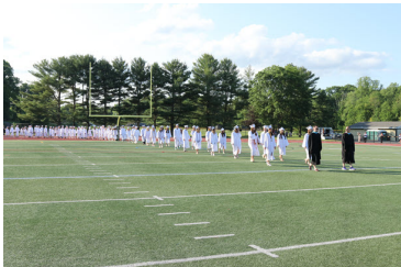
2023 GRADUATION PROCESSION